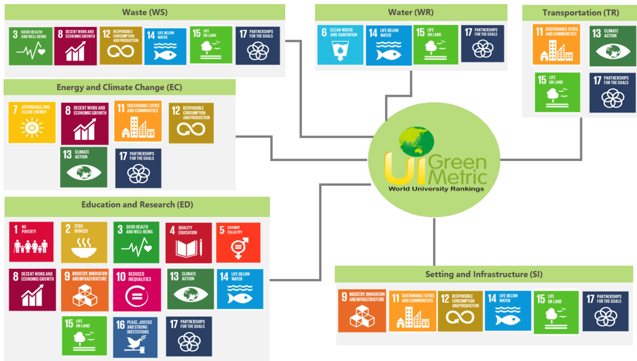
Figure 1. UI GreenMetric and SDGs

UN Environment’s challenge in the 2030 Agenda is to develop and enhance integrated approaches to sustainable development – approaches that will demonstrate how improving the health of the environment will bring social and economic benefits. Aiming at reducing environmental risks and increasing the resilience of societies and the environment, UN Environment action fosters the environmental dimension of sustainable development and leads to socio-economic development (UNEP, n.d.). These 17 aspects of SDGs are captured in the UI GreenMetric criteria and indicators.