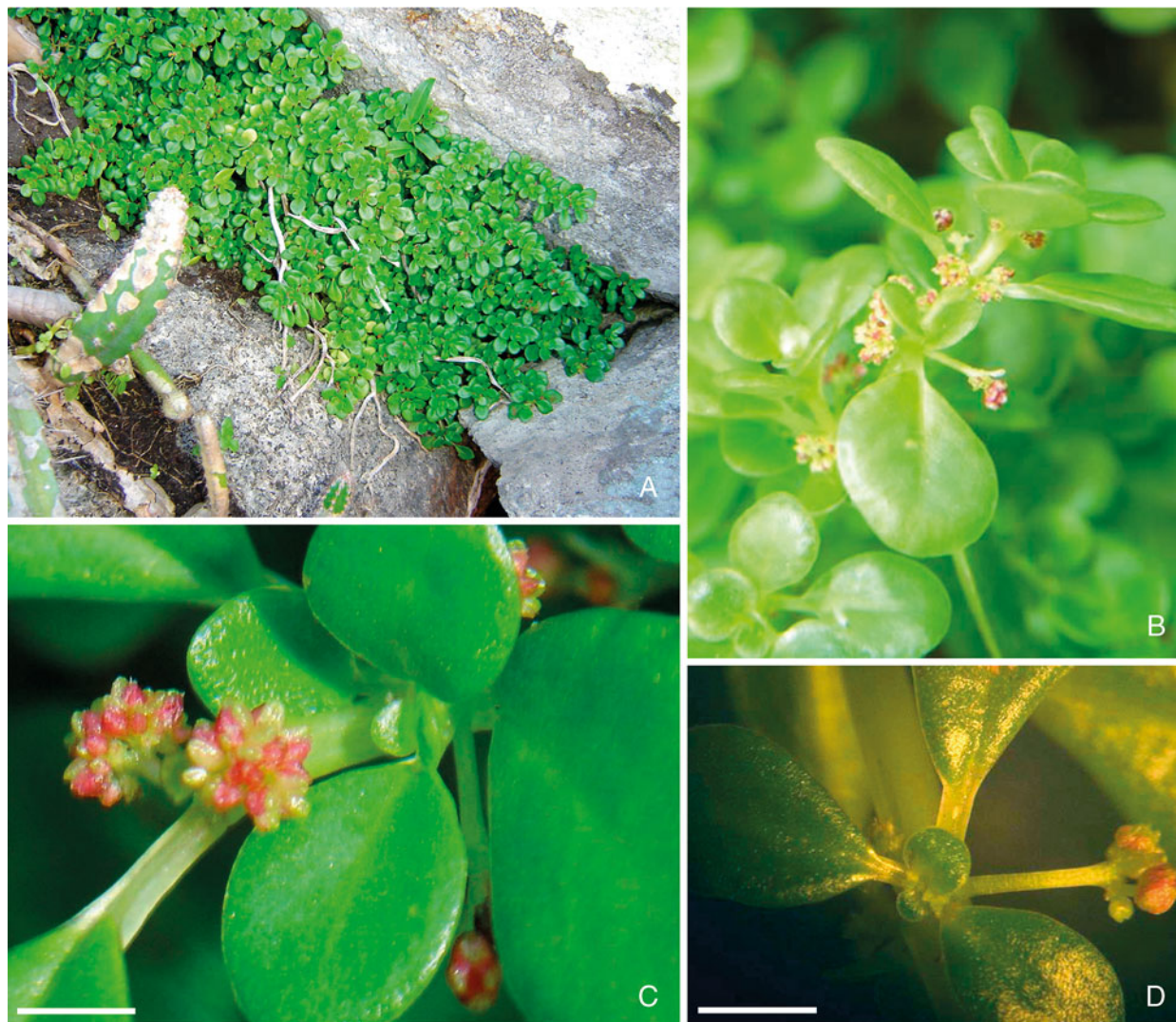
Fig. 2. Pilea carautae. A habit; B apex of fertile branch; C detail of bud, showing pistillate inflorescences (scale: 1 mm); D detail of bud, showing staminate inflorescences (scale: 3 mm).